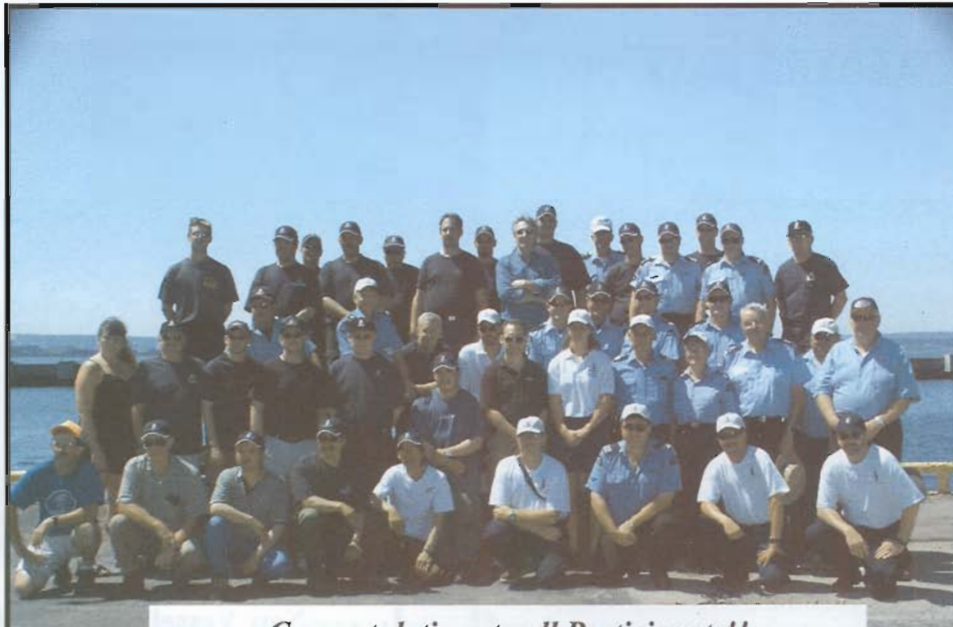
Congratulations to all Participants!!