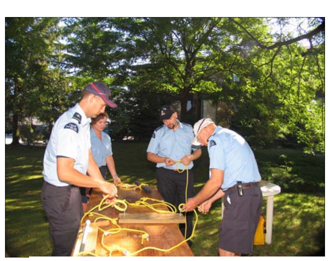
Lines and Knots