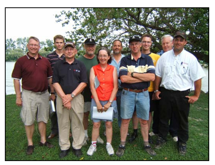
Hold -Up of Materials by Transport Canada

Due to the changes within the Transport Canada, Office of Boating Safety, these CCGA members have not received their decals/pads for 2005.