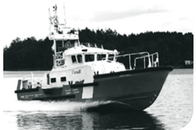
The new Cape Class 47' Cape Sutil, waiting for rough weather.

These new vessels are becoming increasingly relied upon for Search and Rescue purposes, and as such, Auxiliary members should be prepared to see them and work alongside them, if they have not already.