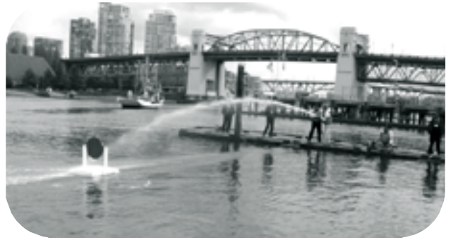
Featured event: pump operations and accuracy.

At the Awards Ceremony, one Canadian and one US team were selected as winners for each event: First Aid, Pump Operation, On the Water Rescue, Best Sportsmanship and the Mystery Event. There was also an overall winner from each country as well as the International