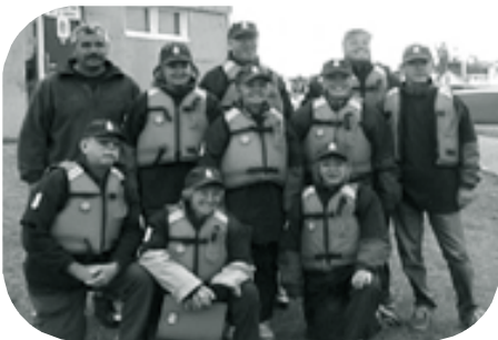
Competitors at the Laurentian SAR competition in Rimouski.