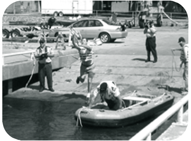
Line throwing event during Central and Arctic's regional competition.

The competition events included a navigation challenge, first aid skill testing, pump operation and accuracy, a radio procedures test, an on water challenge – dead reckoning and search pattern, line throwing accuracy and a pleasure craft courtesy check.