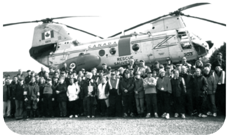
Participants at the SAR skills competition in front of the Labrador helicopter from 103 SAR Squadron, Gander.

The weekend was thoroughly enjoyed by all and plans are already underway for next year's SAR Skills Competition to be held in Marystown, Newfoundland.