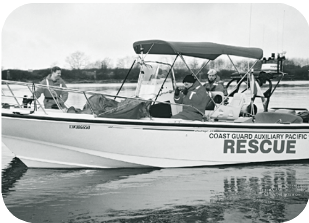
On the water at SARWARS.

Next year’s regional competition will be held in Victoria harbour Friday February 22.