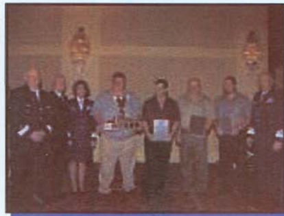
Team Newfoundland and Labrador