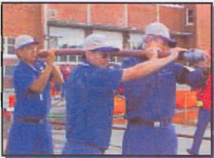
SAR Pump Operations

Congratulations to Team Newfoundland and Labrador, all participants and ISAR organizers for a job well done. Many thanks to the CCGA Board of Directors, the CCG Support staff and all volunteers of the Canadian Coast Guard and 103 Rescue Squadron, Gander who came out to help put off an amazing event. It should be truly difficult to top ISAR 2003 hosted by Newfoundland and Labrador.