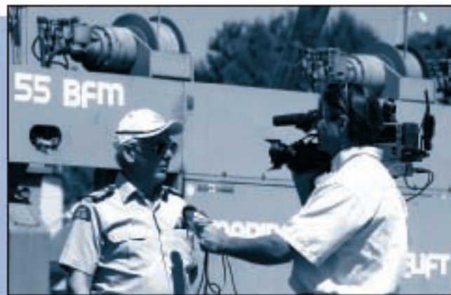
The CCGA – Central and Arctic held a regional competition on August 6, 2005 in Penetanguishene, Ontario.