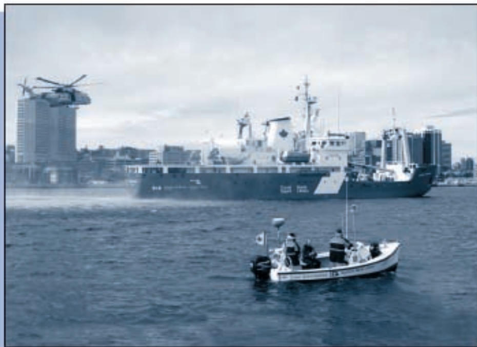
■ Halifax harbour hosted a SAR exercise on Friday, September 30th.