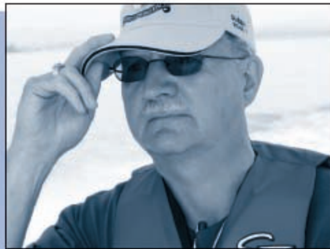
The CCGA – Quebec regional SAR competition took place on August 27, in Lévis, Quebec.