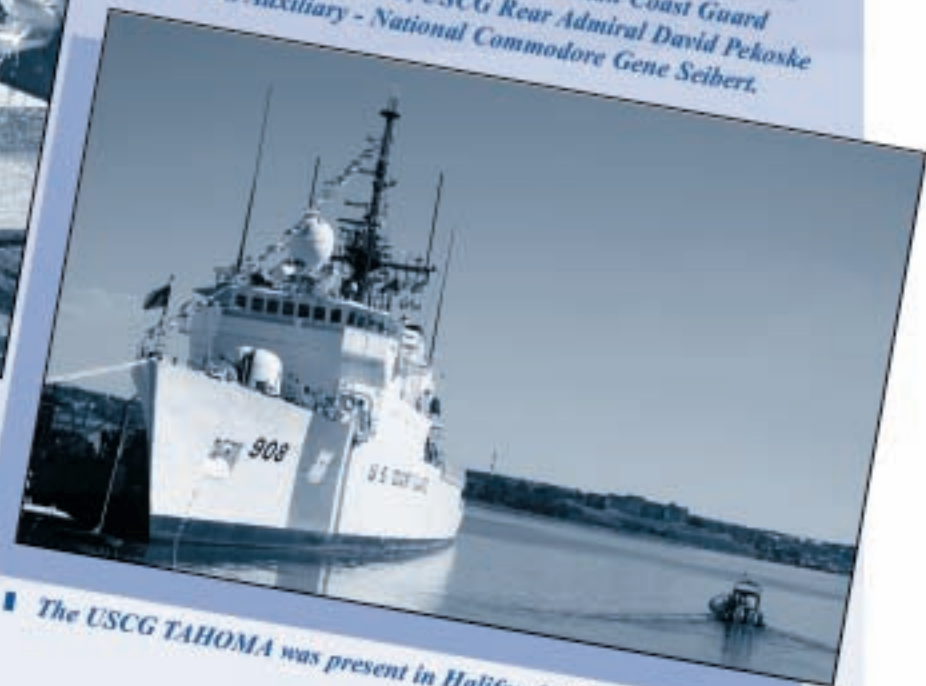
■ The USCG TAHOMA was present in Halifax for ISAR 2005.

View the complete list of ISAR Winning Teams at: http://teamcoastguard.org/2005/ISAR05/ISAR2005.htm