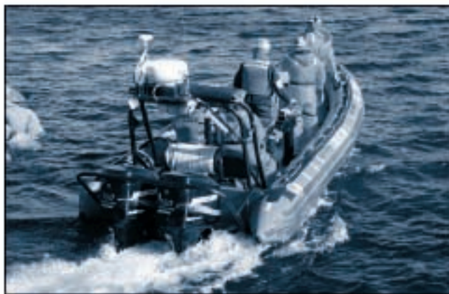
CCGA - Newfoundland and Labrador Regional Competition