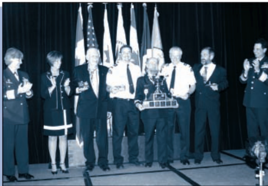
■ Team Canada was the international winner of ISAR 2005. Members received their trophy at the Awards Ceremony on Saturday, October 1st.

The presence of the USCG TAHO MA and the patrol vessel FULMAR from the French gendarmerie maritime was a strong beacon of SAR strength and effectiveness throughout the competition, demonstrating the power of cooperation between nations to increase maritime safety for their citizens and provide them with the means of rescue, should there be any maritime occurrences. ♣