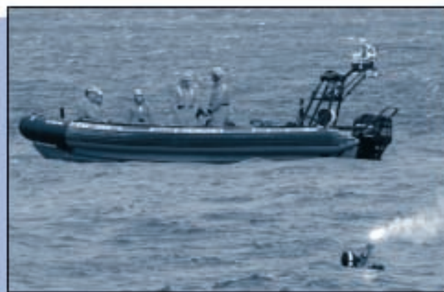
The CCGA – Newfoundland and Labrador competition was held in L'Anse-au-Loup, Labrador on September 24, 2005.