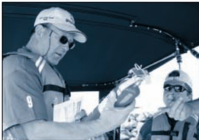
CCGA - Quebec Regional Competition

Regional Search and Rescue (SAR) competitions were held throughout the country, culminating at the ISAR competition in Halifax September 30th - October 1st, 2005. CCGA volunteers proved their mettle and prepared for the ISAR competition with numerous challenges designed to test their SAR knowledge and skills.