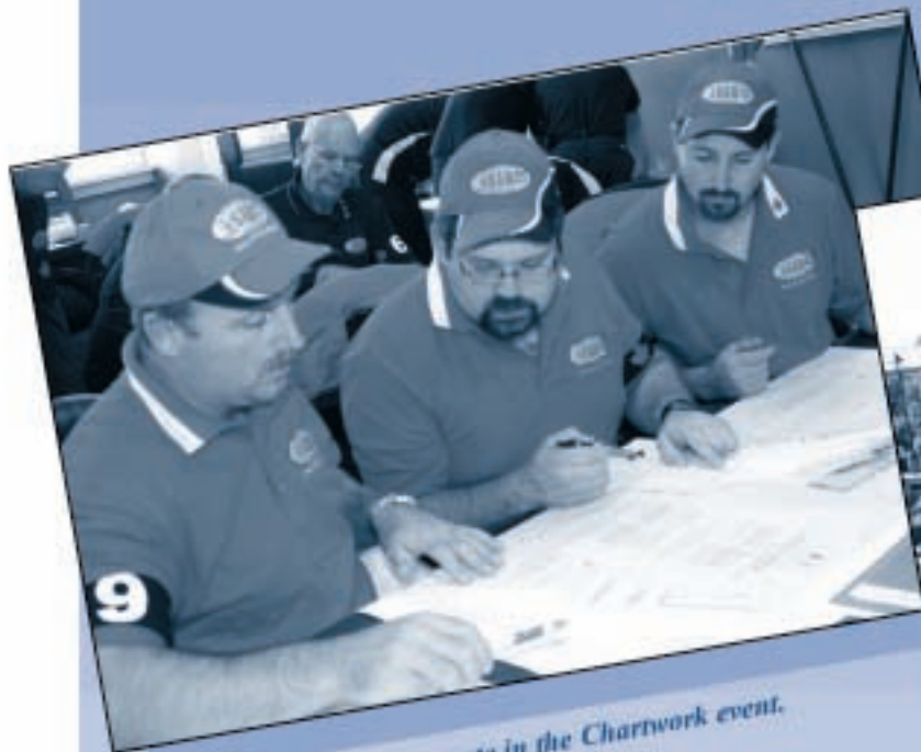
■ CCGA members compete in the Chartwork event.