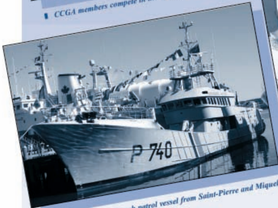
■ The FULMAR, a French patrol vessel from Saint-Pierre and Miquelon.