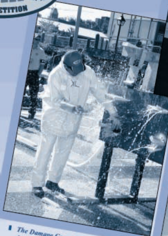
■ The Damage Control event at ISAR 2005, developed by the Canadian Navy, was well received and drew large crowds.