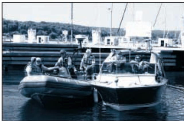
CCGA - Central and Arctic Regional Competition