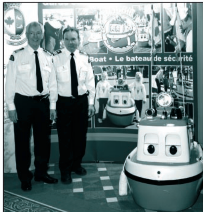
■ Bobbie training sessions were offered to CCGA members in Central & Arctic, Quebec, Maritimes and Newfoundland regions.