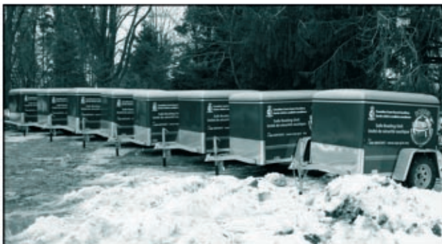
■ Trailers have been designed to take Bobbie to different areas.

With four to six months of prime boating weather coming, it's a safe bet Bobbie will make a positive impact on safety awareness for children. ⚓